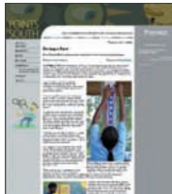
PROJECT: Web Design